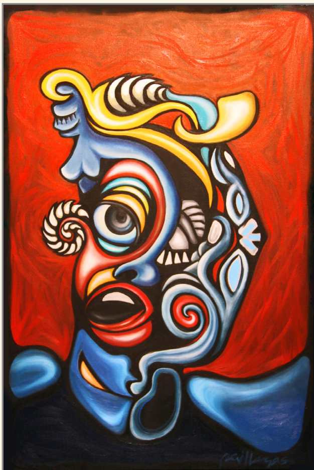
Illuminado (24 x 36 in, oil on canvas)

For information on purchasing artwork, please contact the artist directly at pepearte@aol.com