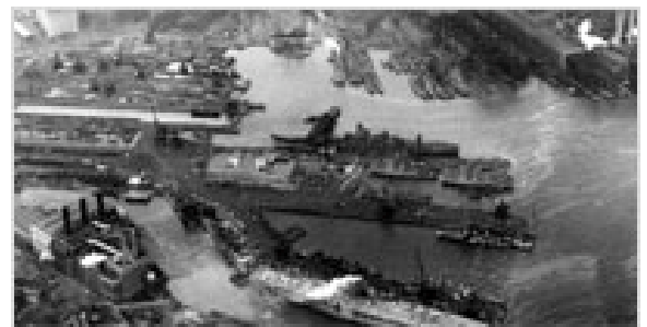
Brooklyn Navy Yard, Pier G, 1944.

The Brooklyn Navy Yard sits off of Wallabout Bay in Northwest Brooklyn along the East River between the Manhattan and Williamsburg Bridges. Constructed on marshland, the shipyard was built here in the late 18 th Century. It came under federal ownership in 1801 when the United States government purchased the land from a private owner for $40,000.