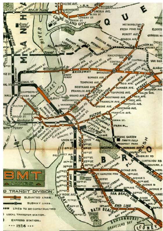
Myrtle Avenue Station is shown above in Downtown Brooklyn on this 1924 subway map

A local organization, Creative Time, and The National Endowment for the Arts were particularly crucial in the realization of Masstransiscope. An artist and filmmaker, Bill Brand's vision was to give subway riders a brief show of moving figures in the midst of their journey below ground. Started in 1974, Creative