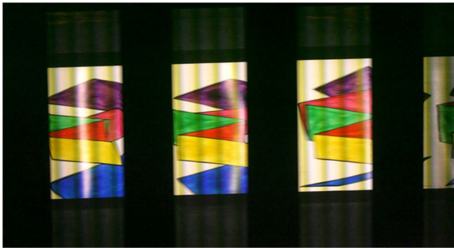
Masstransiscope in the former Myrtle Avenue Station

During the late 80s, the art piece became a target for graffiti and eventually it was entirely covered. Except for a brief uncovering in 1990, it remained hidden until late 2008. This time around, the artist partnered with MTA's Arts for Transit program and used a grant to restore the project. It also received donated services from Metro Clean Express of Long Island City. They cleaned the covered panels for free and the project was restored to its former glory in November 2008. 19 Below is an image of the installation en route to Manhattan.