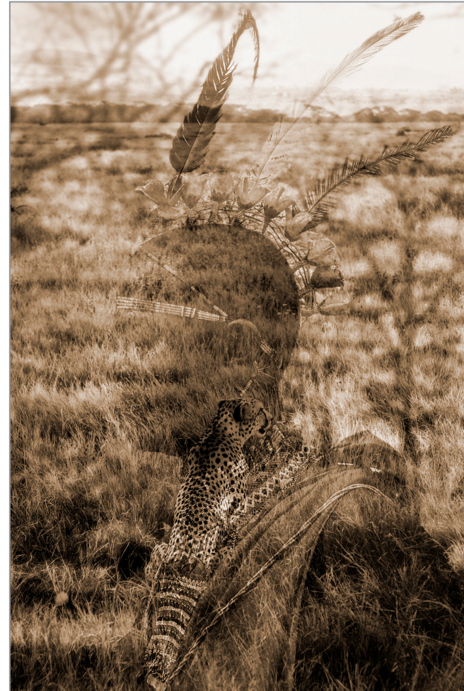
Lone Brother, 2022