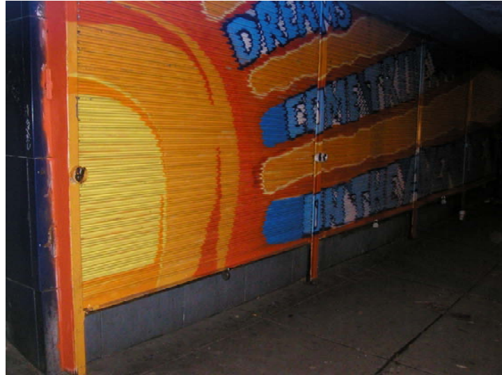
Figure 20 “Dreams come true on the Avenue.” Mural on Sunpay security screen, at the corner of Germantown and Lehigh.

worrying about what other people are caring about, actually if you see something, take the initiative to make a difference.