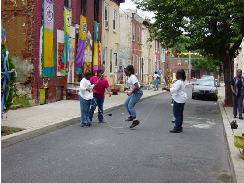
Figure 6 Alder Street during Kujenga Pomoja, October 2, 2004. Banners by Sally Hammerman and Brenda Kennedy.

served by the Village; teens and children, either engaged in their educational activities, or on break, walking, laughing, perhaps dancing on the sidewalks and in the street's main park, Ile Ife Park. The Village as an organization lives on this street and in the buildings of the 2500 block of North Alder Street. The Village as a community, however, extends far beyond this block.