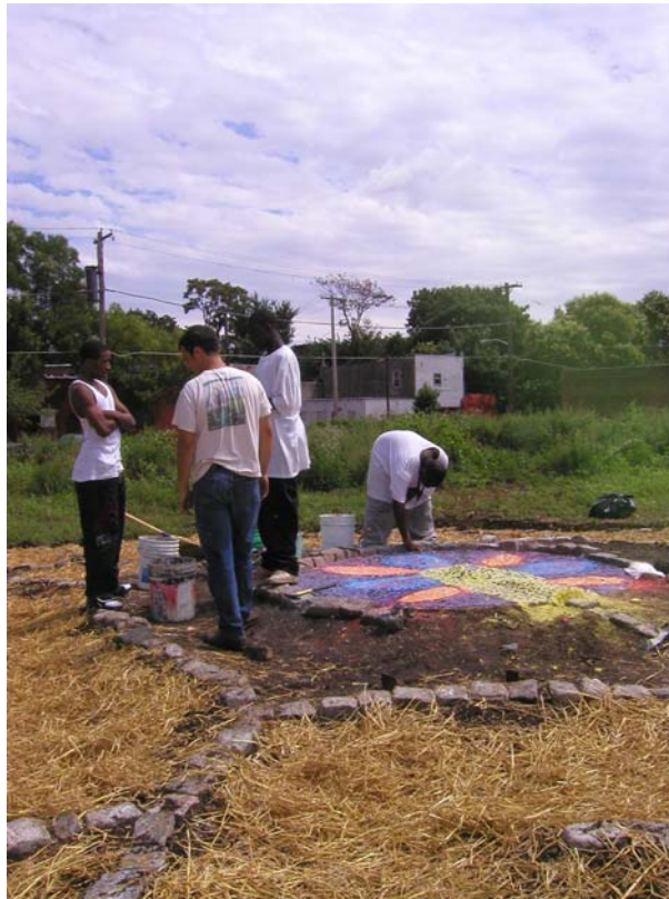
Figure 11 Teens creating a labyrinth at the Village Tree Farm, August 2004.

among people.” People were inhabiting the spaces and transforming them into commons in which they had a creative stake and a sense of ownership. As the Village grew, it began providing after-school and summer camp arts and educational activities for youth; health awareness programs; economic development activities; and community festivals, performances, community gardening, tree farming, and other services.