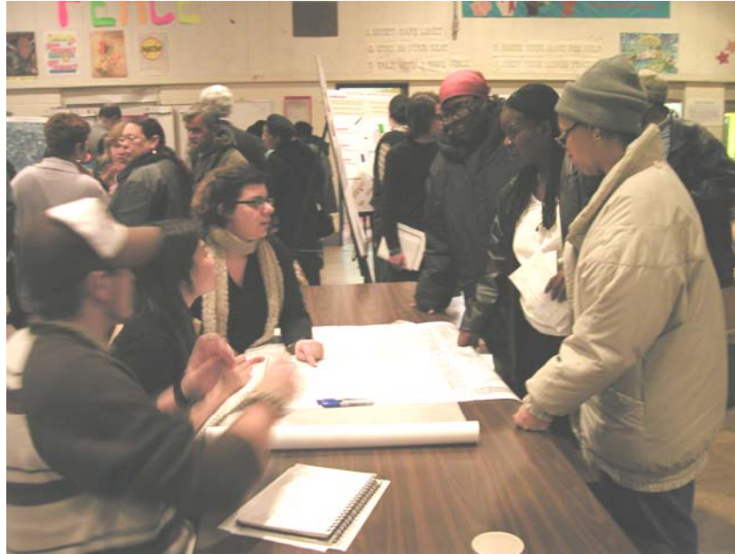
Figure 12 Community meeting with students from Penn Praxis. Hartranft School, April 2004.