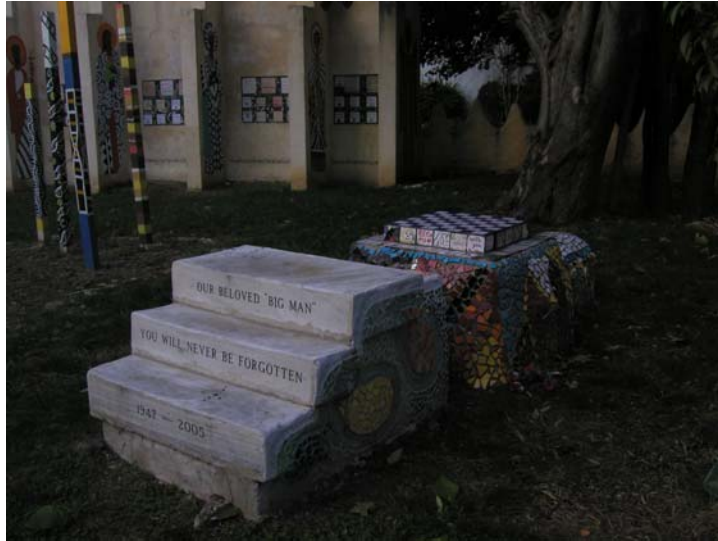
Figure 30 Big Man's front stoop from Alder Street, enshrined in Memorial Park. Mary Hufford

The incubation of such accomplished storytelling begins early in life, through recurrent moments like the one that opened up during the Jubilee Arts Celebration, the concluding event for the Village After School program in June of 2004.