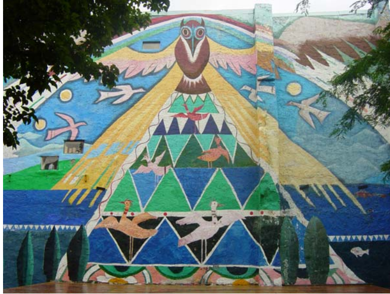
Figure 7 Ile Ife Mural, next to Ile Ife Park.

Out of this project, the Village of Arts and Humanities grew into a multifaceted community greening and arts-based organization. What is called the Heart of the Village now encompasses multiple blocks in a neighborhood that once contained primarily trash-strewn empty lots, abandoned buildings, and drug-ridden, dangerous streets. Now these same blocks are home to art parks, mosaic mural-lined alleyways, community gardens, a vegetable farm and a tree farm, new-construction homes, rehabbed houses that contain administrative offices and other multiuse spaces, and a main arts and education building. The Village provides art, education and neighborhood development programs, social services, and many other services all through an emphasis on the arts and a mission to “do justice to the humanity of people who live in inner-city North Philadelphia and similar urban situations” (1).