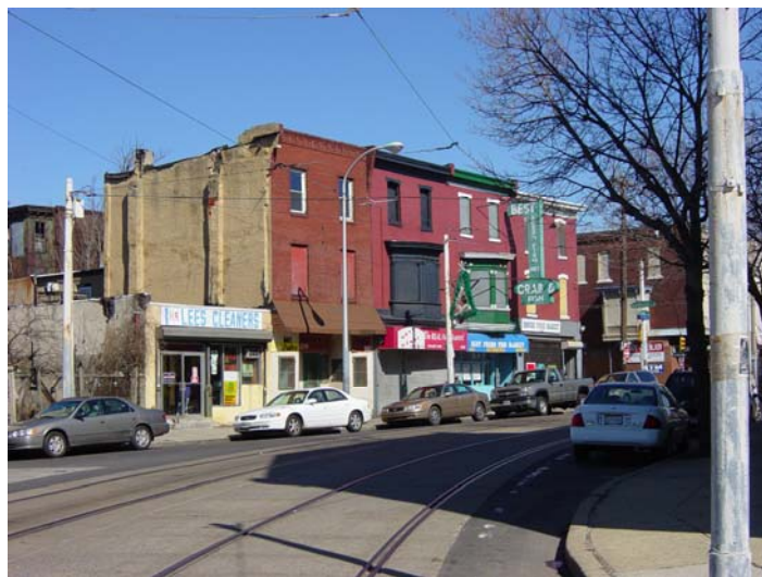
Figure 17 Germantown Avenue, near its intersection with Alder and Tenth Streets.

teems throughout the day with people walking up and down the Avenue. At the top of Alder, the street bears to the right to run perpendicular into Germantown Avenue. To the right on the Avenue is the main entrance to the Village. In the block to the left of Alder is, first, a Chinese food restaurant, then an abandoned lot, then a one-level building housing Lee's Cleaners (1 Hr). The next four buildings are three-story; in each building, the second and third floor windows are boarded up (except for the first building, which has open windows up top). The second and third buildings have bay windows on the second floor. The first of these buildings contains a store that has several Live Poultry signs on it but looks to be abandoned. Next door is a salon with the name Hott Headz on a red awning. Beside this the Best Fresh Fish Market (Crab and Fish) announces its name on an awning and also on a vintage sign from an earlier era. Empire Food Market, the last building on the block, is a small store on the corner of Germantown Avenue and Huntingdon.