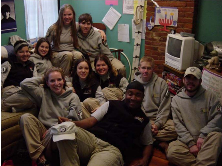
Figure 32 AmeriCorps Volunteers, Christmas on Alder Street, 2004.

am trying to build community, and you are telling me to put up a fence!” She also eschewed the boundary between insiders and outsiders, excluding no one from participating in the work of the Village. But she was clear on the need to draw a line between the kind of development that would erase the community by alienating it from its community spaces and assets, and the kind of development that builds on those spaces and assets: human and community development. There is a difference here between boundaries that are barriers, obstacles to communication, and boundaries that are buffer zones, that help to preserve a sense of self while providing a space for the communication that builds relationships, that reaches toward chiasm, toward, as Kumani Gantt writes, cutting the cord and breathing in the other.