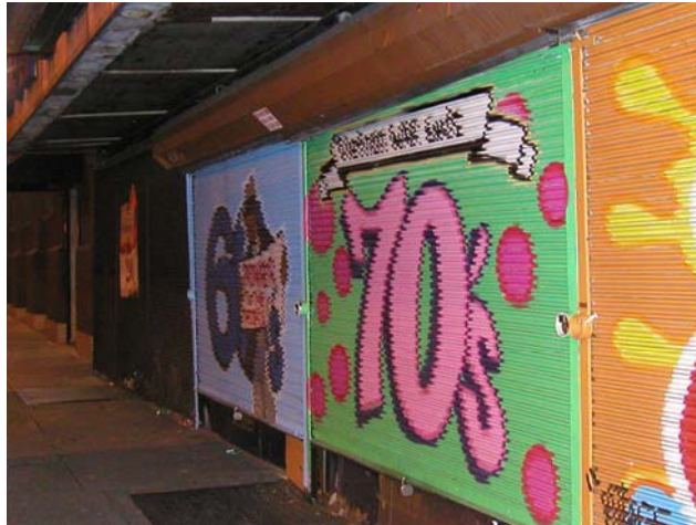
Figure 18 Painted security screens at Germantown and Lehigh Avenue.

barriers to buffer zones, serving like Robert Frost's "Mending Wall" as a boundary that grows into a meeting place. Tending this space together, the neighborhood and business community build a relationship. The painted screens articulate, protect, and celebrated the relationship that has been transformed through artistic engagement.