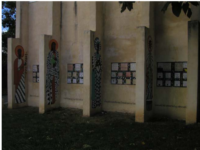
Figure 21 Names of graduates of Edison High School who died in Vietnam, enshrined on the wall of a building adjacent to Memorial Park.