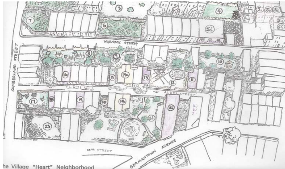
Figure 8 Village parks, gardens, and rehabilitated dwellings.