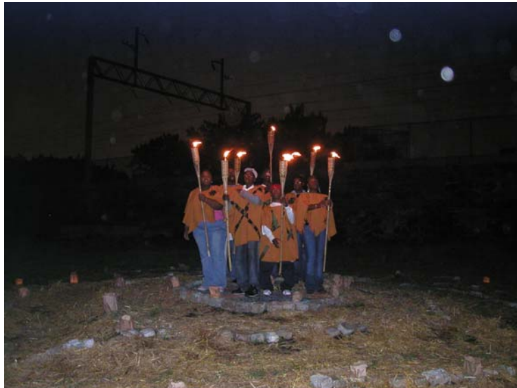
Figure 3 Village youth standing on top of the labyrinth at the conclusion of the Kujenga Pamoja ceremonies, October 2, 2004.