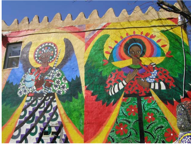
Figure 15 Guardian Angels Mural, Guardian Angel Park.

Cosmogenesis is a process of reconnecting community and environment. It humanizes space, and places humans by changing the narrative of development with attention to such minute details: learning that there is a place where it is safe to express themselves, children re-enter a time of human development. In the following sections of this ethnography, we look at how five resident-led Shared Prosperity initiatives worked to humanize spaces that had been dehumanized, while building community life through creative action and artistic practice. We examine fragments that the Shared Prosperity process is piecing into a new context with new meanings including: the four quadrants (meetings at Cookman); neighbors separated by fear of drugs and violence (block captains and neighborhood walks); body and environment (health empowerment project); ecology and economy (land transformation, paintings on security screens); professional life and civic engagement (Americorps volunteers, merchants).